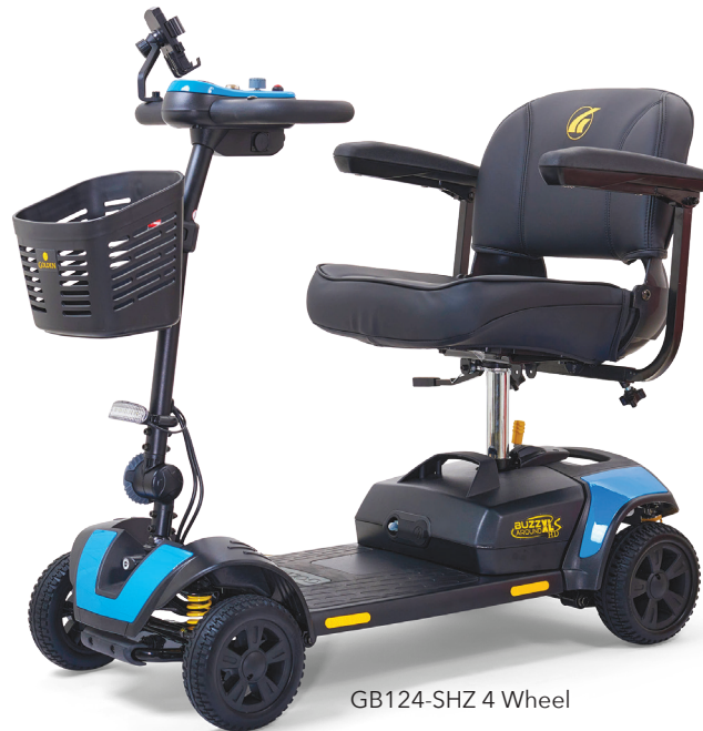
GB124-SHZ 4 Wheel